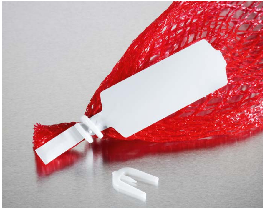
Patented plastic clip for secure closure of netting with DCD P 600 N