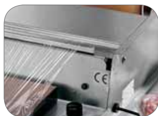
1. Particolare filo caldo (1) Heated cutting tread (1)