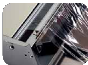
2. Profilo teflonato (2) Teflon-coated section (2)