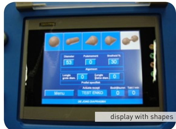
display with shapes