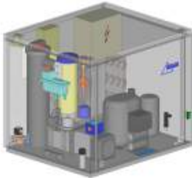
High quality components ...