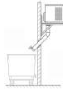
Ice production into an ice trolley