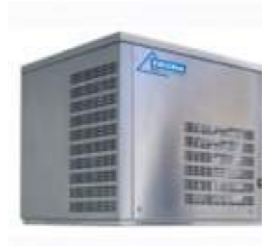
...in a sturdy stainless steel cabinet