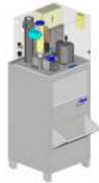
Ice machine with storage bin B200