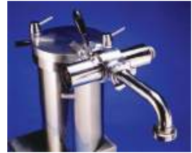
Portion Control (option)

These stuffers are provided with features that set it apart from others and ensure its success in the market place.