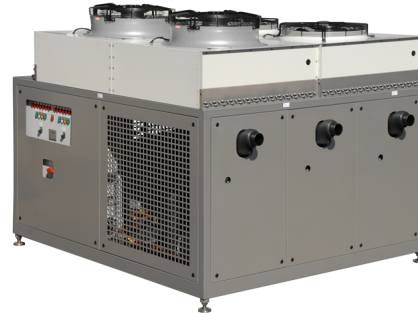
... in an industrial design.