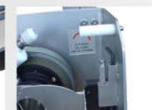
Includes threading machine with integrated support near the key for dismantling blades.