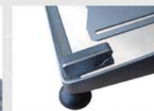
Its design without base prevents accumulation of dirt and makes its cleaning easier.