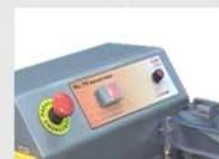
4 types of interval between tying to adapt to all types of products. A lighted led indicates the active mode.