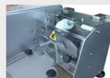
The transparent lid makes work easier with maximum security.

POWER: 0,5 CV (0,35KW) TYING LENGTH: 15MM TO 250MM CONSUME: MAXIMUM PRODUCT DIAMETER: 45 TYING SPEED: ADJUSTABLE FROM 15 TO 90 PORTIONS/MIN THREAD CUTTER: INTEGRATED PRODUCTION: DEPENDING ON SIZE THREADING MACHINE: INCLUDED WITH INTEGRATED SUPPORT TREAD LAPS PER TYING: 4 LAPS (2,5 EFFECTIVE) TRANSMISSION: REDUCER ENGINE AND TOOTHED BELT THREAD TENSION ADJUSTMENT: THROUGH PRESSURE REGULATOR STANDARD NETWORK VOLTAGE: 220V MONOFASIC 50/60HZ