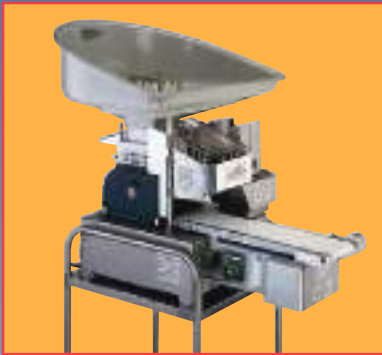
Super Portioning Machine with Programmable Counter and Conveyor