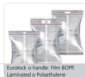
Eurolock o handle: Film BOPP, Laminated o Polyethylene