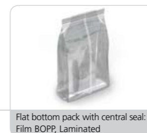
Flat bottom pack with central seal: Film BOPP, Laminated