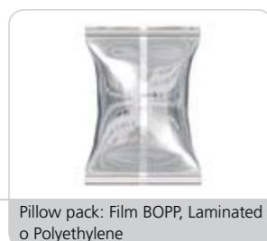
Pillow pack: Film BOPP, Laminated o Polyethylene