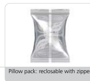
Pillow pack: reclosable with zipper