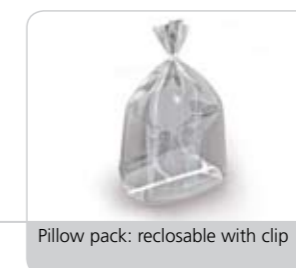
Pillow pack: reclosable with clip