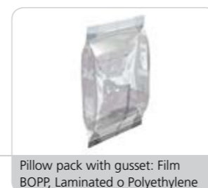
Pillow pack with gusset: Film BOPP, Laminated o Polyethylene