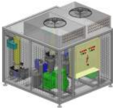
High quality components ...