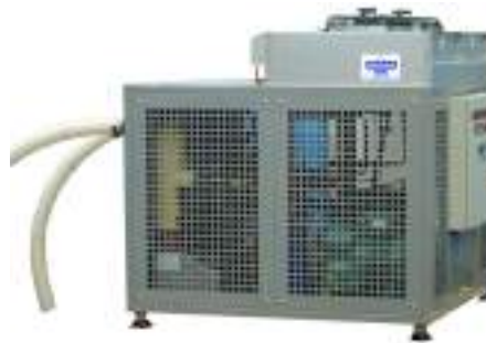
... in an industrial design.