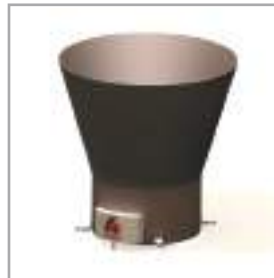
Various Size Hoppers