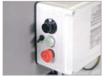
Variable Speed Control