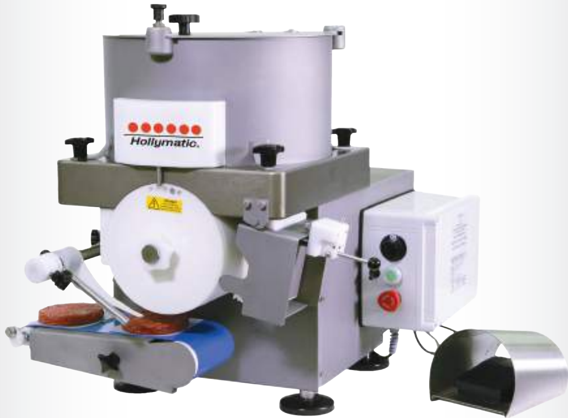
TABLE TOP MODEL

The Hollymatic Self-Feeding Model R2200 is the ideal solution for many small to medium size establishments.