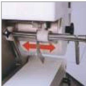
Auto Wire Clean