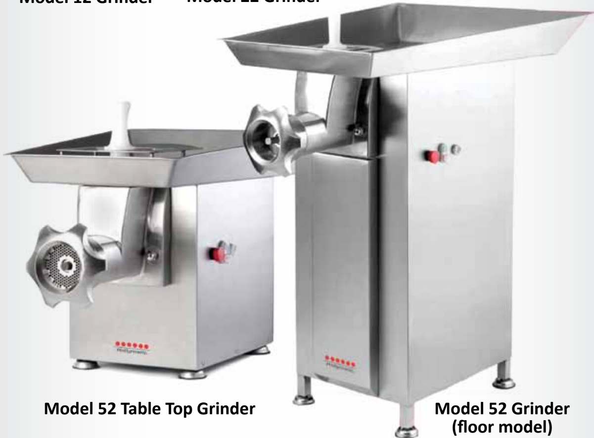
Model 52 Table Top Grinder