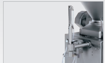
Portioning head 85-2