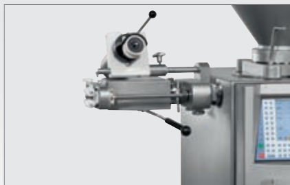
Casing spooling device DA 78-6