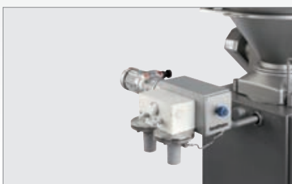
Meat ball forming device 79-0