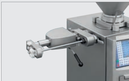
Holding device HV 416