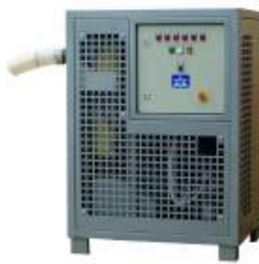
... in an industrial design.