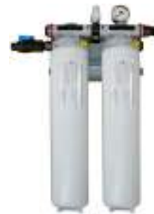
Cartridge waterfilter 180-2

Technical details: please see respective machine specification. With pleasure we submit to you any further information, also regarding your special requirements