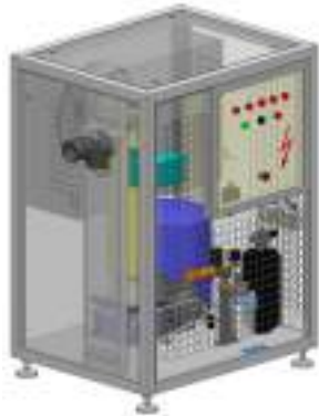
High quality components ...