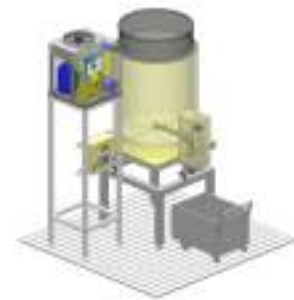
Silo AS 500 with ice machine