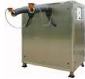
Ice maker with control system and stainless steel cabinet....