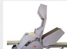
The protection of double opening allows easy and safe access.

SAFETY: SAFETY CONTACT LID OPENING ACCORDING TO THE CE STANDARDS CHAIN TRANSMISSION: ANGLE OF OUTPUT BELTS: ADJUSTABLE HEIGHT PROTECTION OF DOUBLE OPENING: INLET AND OUTLET