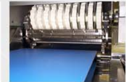
D3000 uses a floating blade holder system that allows a perfect fitting to any piece.