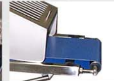
The outlet conveyor belt is adjustable in height to fit any table.