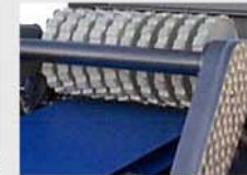
the conic attacking gums tense the piece for an optimum peeling.