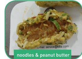
noodles & peanut butter