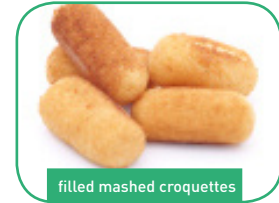
filled mashed croquettes