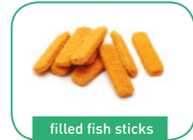
filled fish sticks