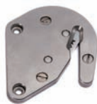
Knife with stainless support