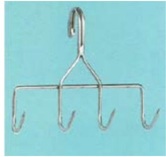
Hook for Bacon