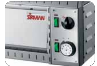
2. Comandi Stromboli Stromboli Controls