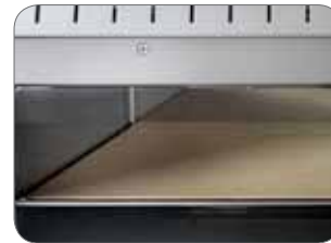
1. Piano di cottura in pietra refrattaria Stone baking deck