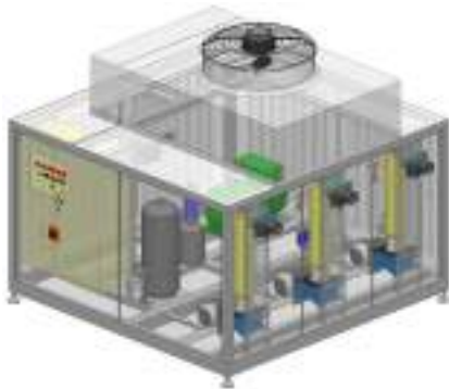
High quality components ...