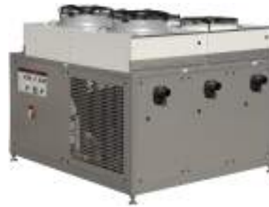
... in an industrial design.