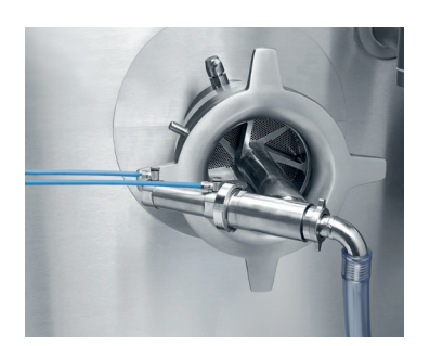
Pneumatic separating device