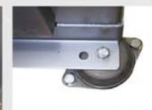
The legs with integrated silen blocks prevent vibration and allows the machine to come to anchor to the ground.