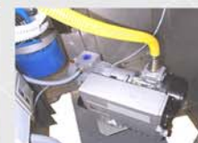
Vacuum pump BUSCH programmable from tactile operator control panel.