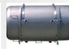
Sliding lid with wide opening, compatible with standard elevator and unload on carrier.