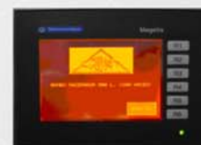
Time, turn direction and vacuum are programmable from tactile operator control panel with programme memories.