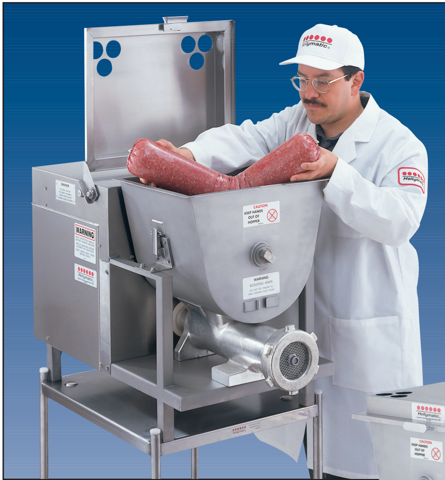
CONVENIENT HEIGHT MEANS EASY LOADING FOR ALL OPERATORS.