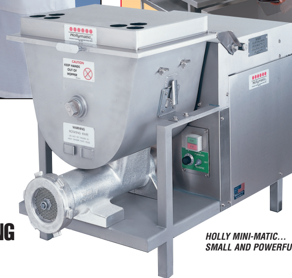
HOLLY MINI-MATIC... SMALL AND POWERFUL