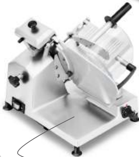
START-L 220 - 250 - 300