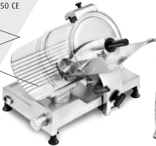
START 300/350 CE