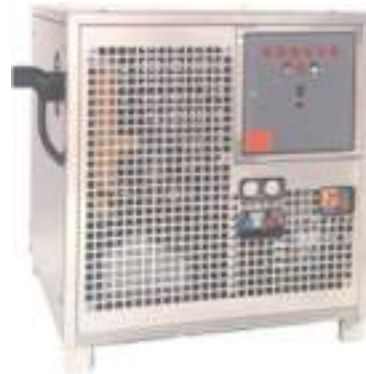
... in an industrial design.