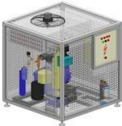
High quality components ...