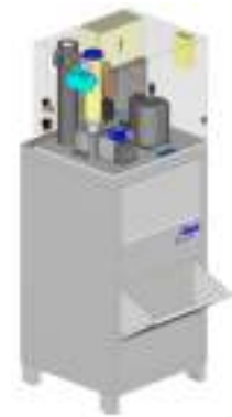
Ice machine with storage bin B200