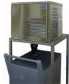
Ice production into an ice trolley