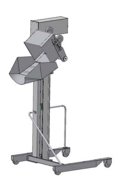
Loaders available with wheels for portability