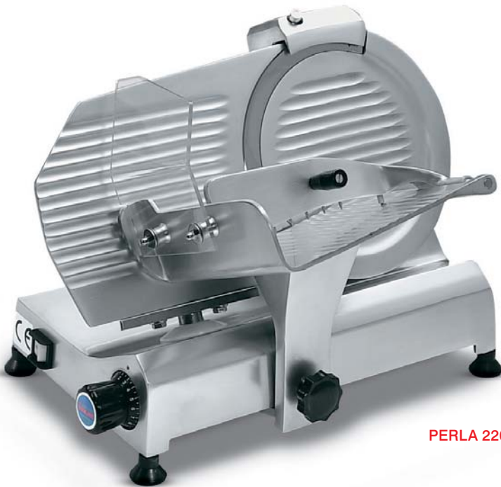
PERLA 220 A.I.-250