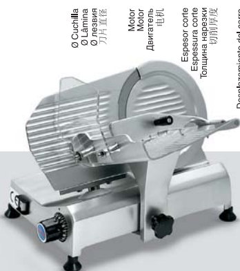
PERLA 195 - 220