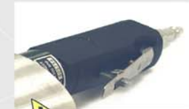
The four-square thermoplastic body for the engine offers a secure grip without slipping, as well as lightness and hygiene.