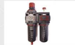
The group air filter 1/2" ensures maximum hygiene.