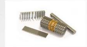
The roller and the comb are extracted in a few seconds for an effective cleaning.