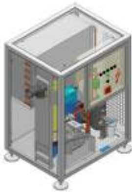
High quality components ...