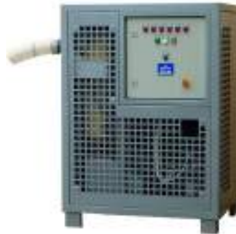
... in an industrial design.