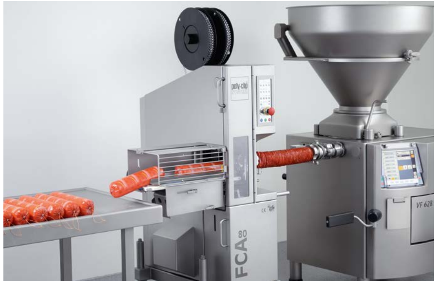
Powerful for large calibres