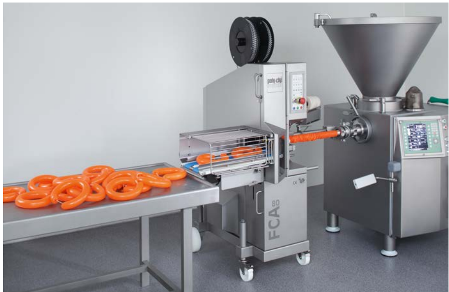
FCA 80 with adjusted front flap and double-conveyor belt specifically for rings

ES 5000 – labelling system for marking and traceability